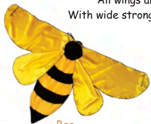
Bee $38 each + gst

All wings are satin and tails are soft. With wide strong elastic centre back and wrists.