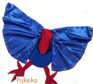
Pukeko $56 each + gst