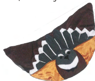
Fantail $60 each + gst