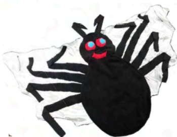
Spider $60 each + gst