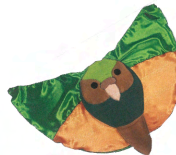
Kakapo $56 each + gst