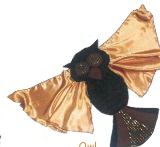
Owl $50 each + gst