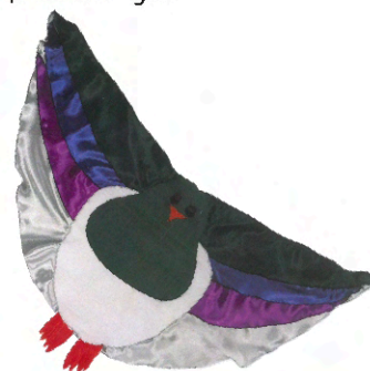
Kereru $56 each + gst