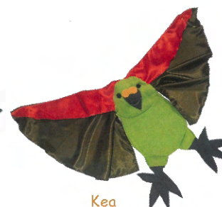
Kea $56 each + gst