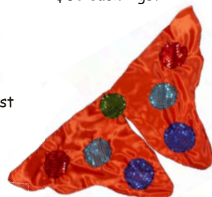
Butterflys $25 each + gst Available in many colours