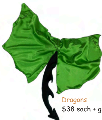
Dragons $38 each + gst