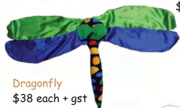
Dragonfly $38 each + gst