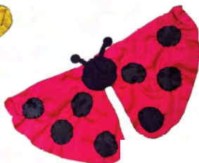
Ladybird $38 each + gst