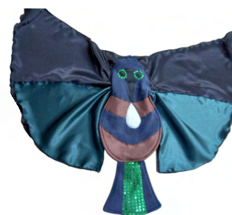
Tui $56 each + gst