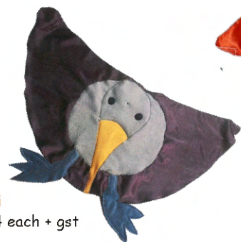
Kiwi $54 each + gst